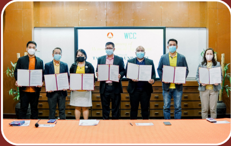
TSU and WCC, WCC ATC seal partnership through MOA