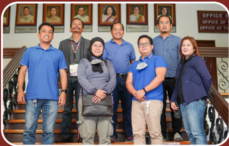
Pampanga Provincial Agriculturist eyes TSU's solar irrigation pump to help farmers counter oil price hike