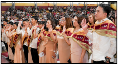
TSU conducts Mid-Year Graduation Page 3