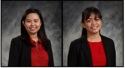
Newly Appointed Section Heads Named under Office of Student Affairs and Services Page 2