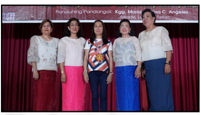
Wikang Katutubo: Tungo sa Isang Bansang Filipino To page 4